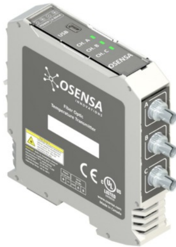
FTX-300-LUX+ Signal Conditioner