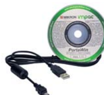
CD PortaWin and USB cable