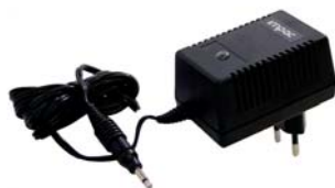
Battery charger for the charging connector of the pyrometer